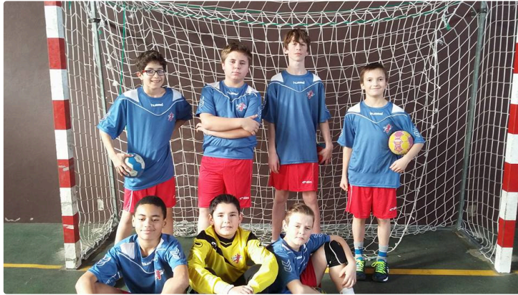
CONDOM / HANDBALL /